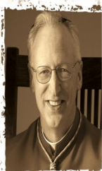
BISHOP BOYE MASS