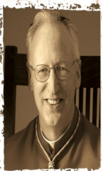
BISHOP BOYE MASS